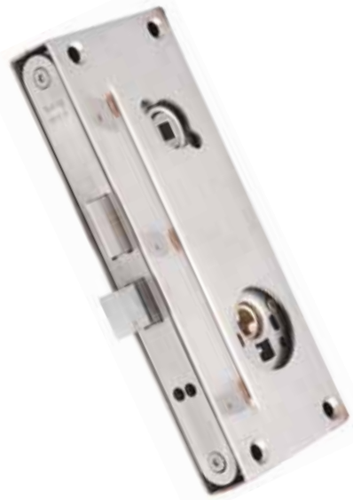
Lock case 5312/8/5390