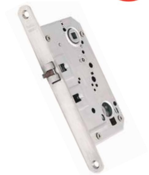
Lock case 5336/8