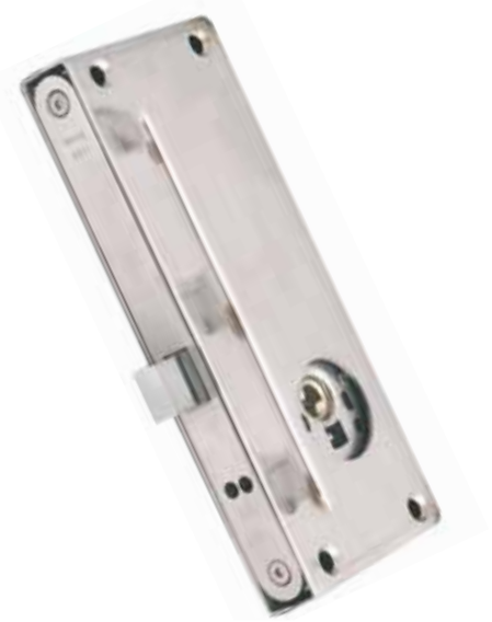
Lock case 5341/8/5390