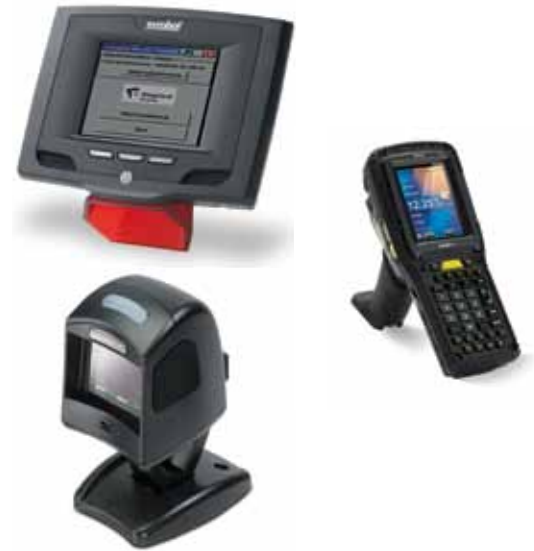
Optional Muster Control system scanners

The rough scanner is classified IP64 and built to withstand drops from 1.5 metres.