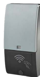
VingCard Remote Controller