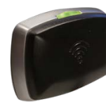
VingCard Elevator Controller